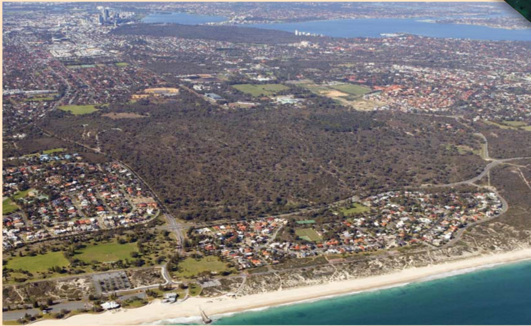
Aerial view Bold Park

Covering 437 hectares, Bold Park is one of the largest remaining bushland remnants in the urban area of the Swan Coastal Plain.