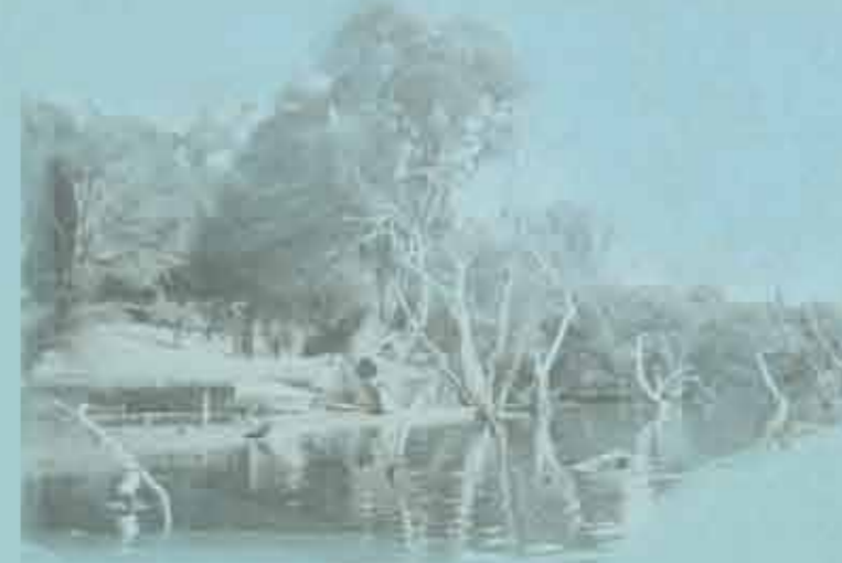
Lake Claremont, c1953