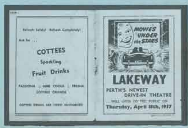
Lakeway Drive-In Theatre Advertisement 1957

ANZAC Cottage is of significant historic and social value and is listed on the State Register of Heritage Places. When the cottage was under threat of sale and/or demolition in 1999 the public outcry that occurred is evidence of its importance to the local community.