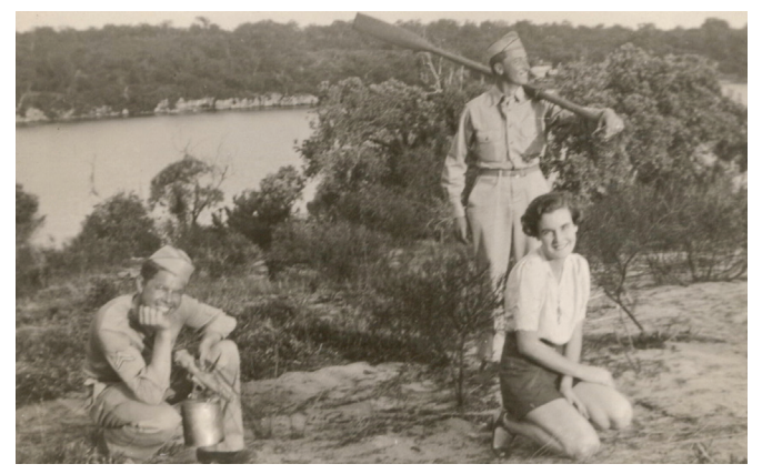
MISS KELLY AND TWO AMERICAN SERVICEMEN AT BLACKWALL REACH, 1942.