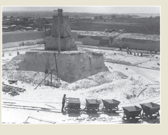
The construction of a reservoir around the obelisk on Buckland Hill, 1935.

Participants following the trail do so at their own risk.