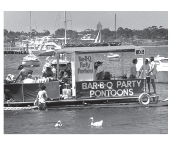
Bar-b-q Party Pontoon on the Swan River, Mosman Park, 1989.

The Grove Library maintains a community history collection about the people, places and events that have shaped the history of Cottesloe, Peppermint Grove and Mosman Park.